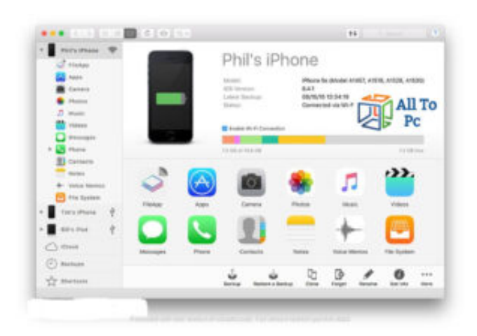
IMazing For Mac II Full Version II Free Download II 100 Working